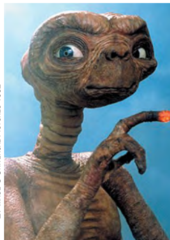
ET IMAGE