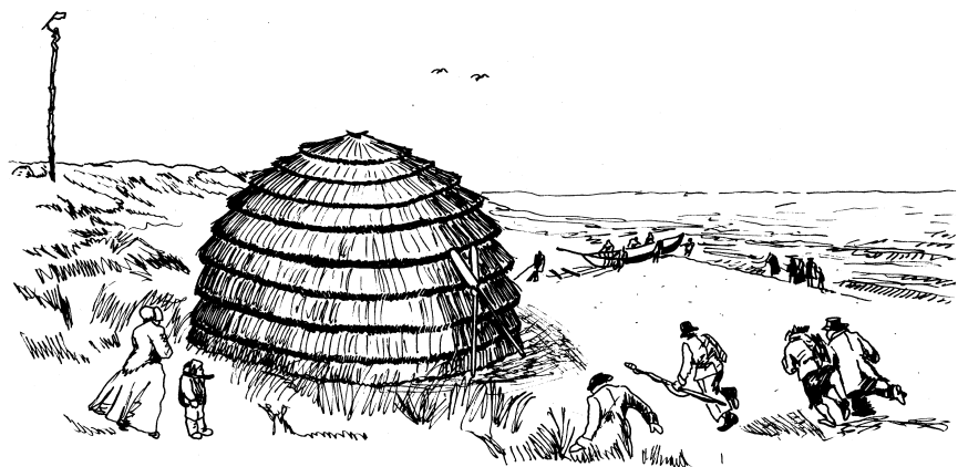
Fig. 1. Conjecture of a Whale Sighting by a Coastal Wigwam (See note 4).

with pins for steps were used by lookouts. 3 A second eyewitness on eastern Long Island said that “occasionally at long intervals, small thatched huts or wigwams on the highest elevations were observed with a staff projecting from the top. These huts were occupied by men on the watch for whales.” 4